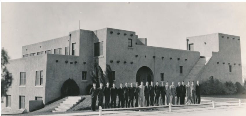
Members of the chapter outside of their house at 1023 Tyndall Avenue, taken in 1934.

Have a picture to share, maybe an old composite or party photo? Send it along! We're also looking for photos of the former chapter houses.