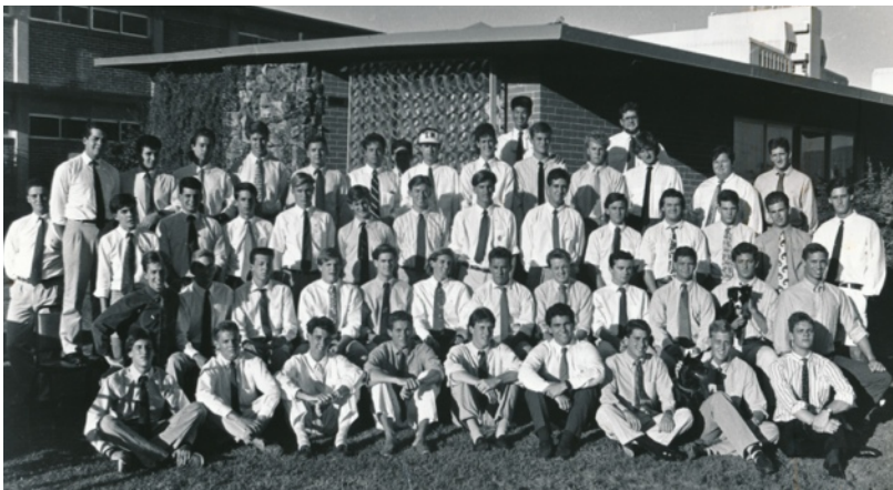
The chapter poses for its yearbook picture outside the house at 1402 N. Cherry St., fall 1989.