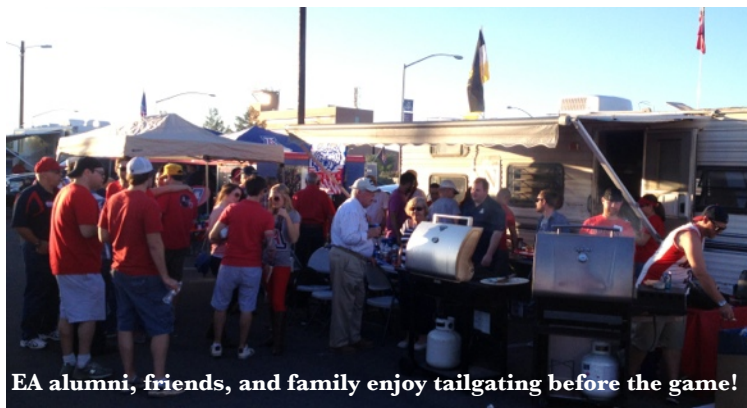
EA alumni, friends, and family enjoy tailgating before the game!