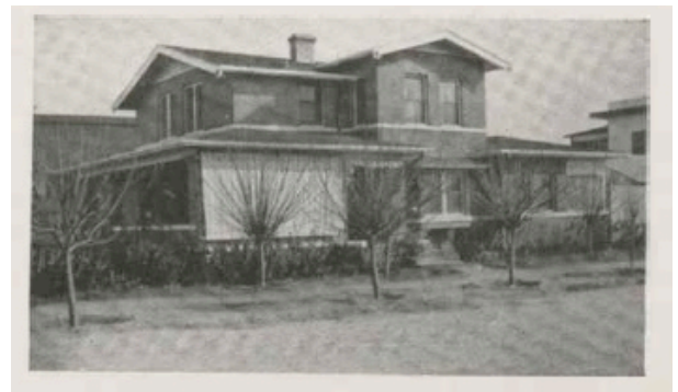
The first Sigma Phi Beta / Sigma Nu chapter house, 745 N. Stone Avenue. Photo from the 1916 Desert yearbook.