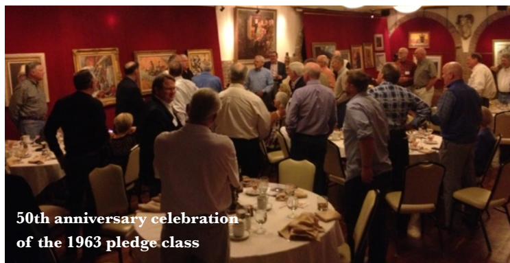
50th anniversary celebration of the 1963 pledge class

Be on the lookout for information regarding Homecoming 2014, November 7 th and 8 th . You can find out the latest information at www.arizonasigmanu.com .