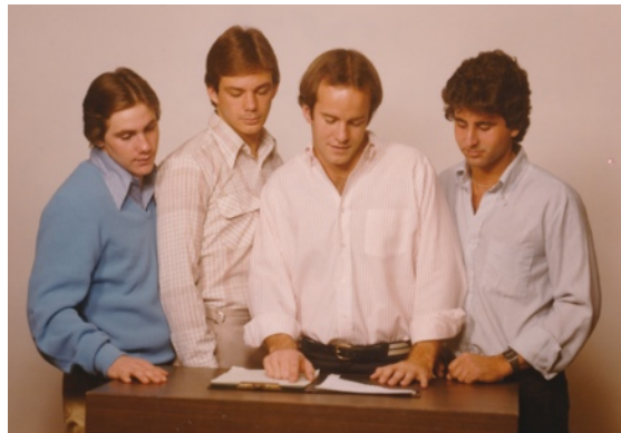
EA executive officers, 1978, perhaps looking over the list of prospective candidates, or maybe something else? Anyone recognize these men?