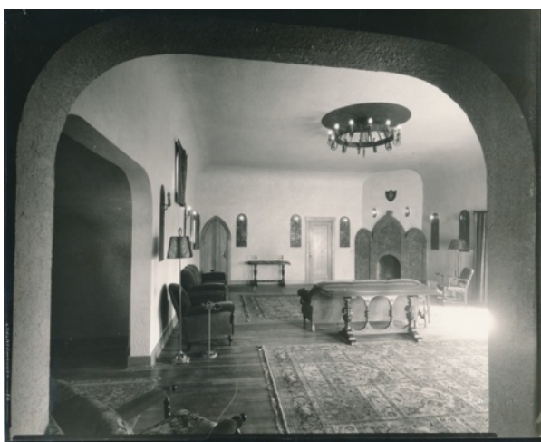
Interior of the EA chapter house on Tyndall Avenue, date unknown but probably circa 1930s.